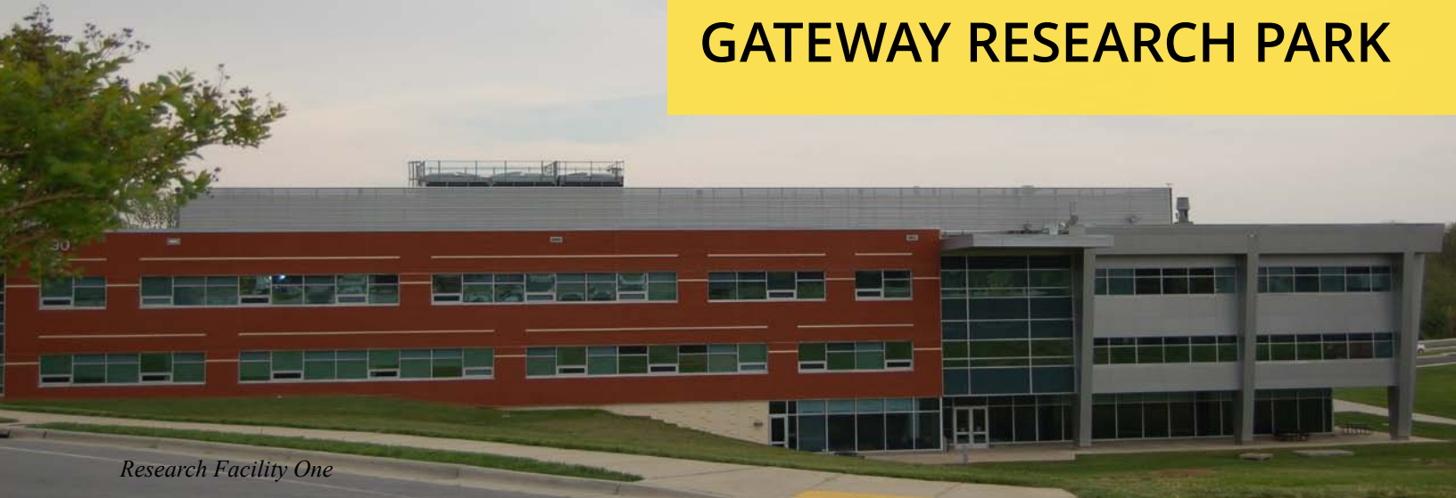
Research Facility One