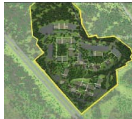
MASTER PLANNED CAMPUS