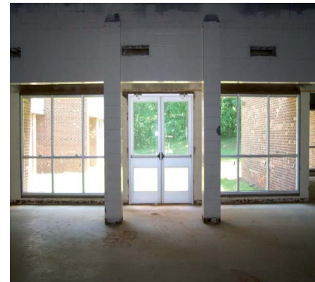
SHELL SPACE AVAILABLE