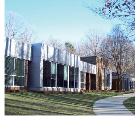
OFFICE SPACE AVAILABLE FOR LEASE