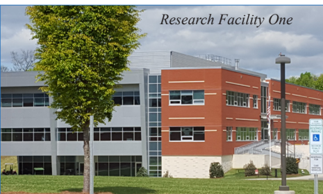
Research Facility One