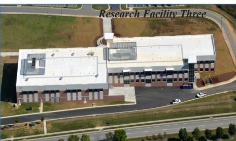
Research Facility Three