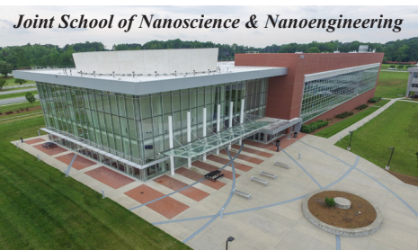
Joint School of Nanoscience & Nanoengineering